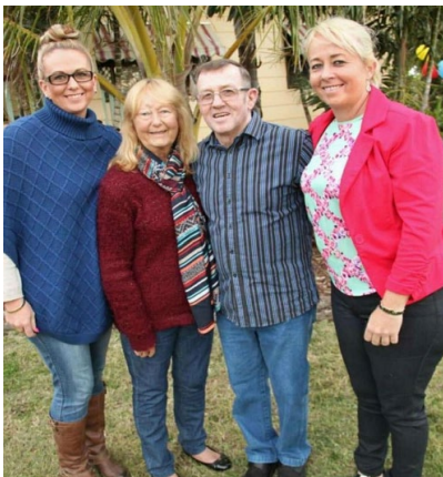
The Welburn Family